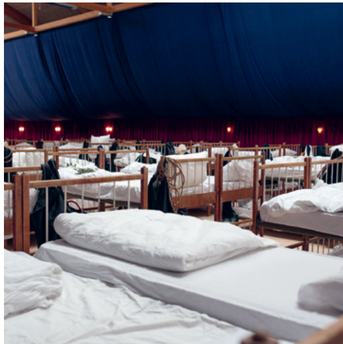
Arriving to the sleep over quarters in the city. Sensuous City by Sisters Hope.