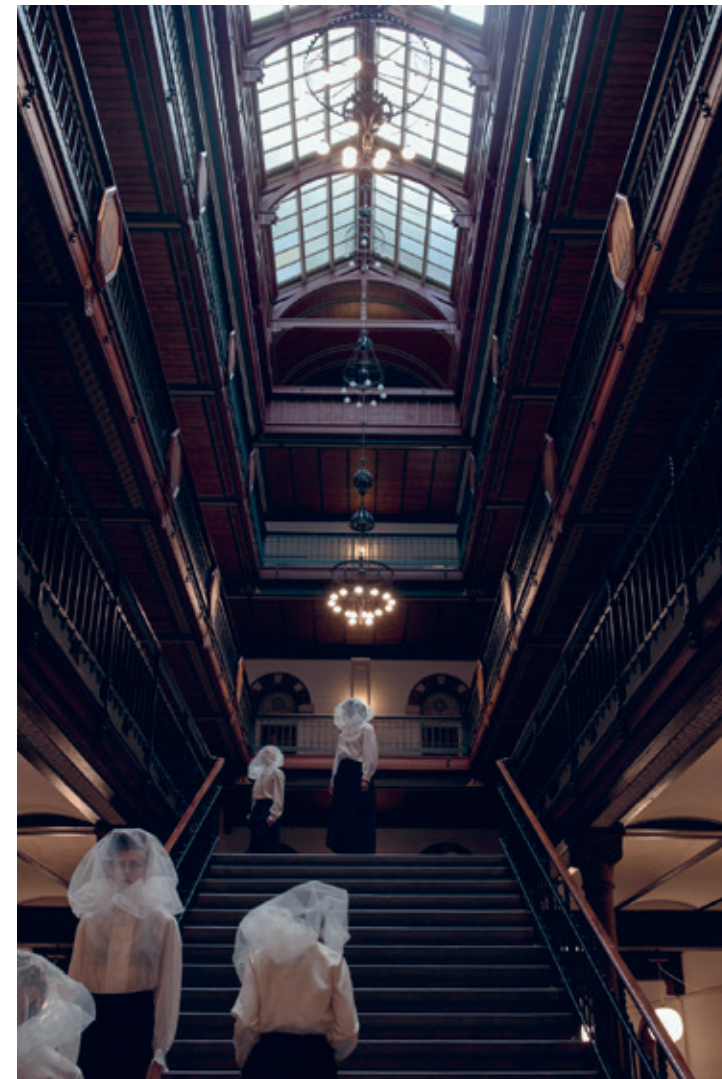
Evokers in back offices in Copenhagen City Hall. Sensuous City by Sisters Hope.